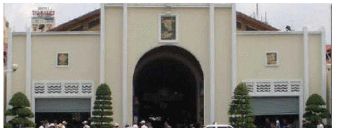
Ben Thanh Market

One of the earliest surviving structures of Old Saigon and is an important symbol of Ho Chi Minh City popular with tourists seeking souvenirs and local cuisine.