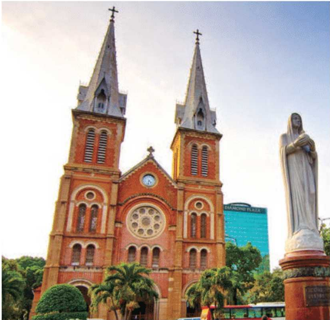
Saigon Notre-Dam Cathedral

Built in 1880 by French colonialists with Romanesque architecture style.